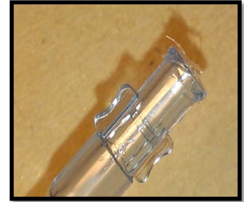
Figure 2 - Picture of reported issue